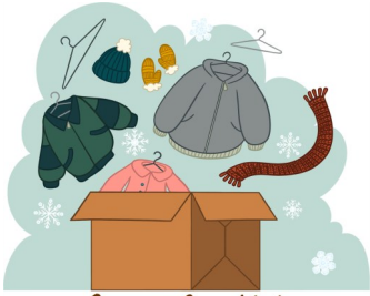
Coats for Kids

Birthright needs winter coats and winter clothing in sizes preemie to 3T. Size 2 is always needed.