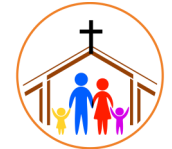
LITTLE ZION PRESCHOOL

+++++ The Sixth Sunday of Easter May 9 & 10, 2026 + + + + +