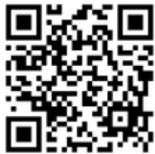
2026 Growth Survey

We ask that each member fill out this survey. Physical copies are available at the church and can be returned in the blue box labeled "Survey Responses" that you'll find in the lobby. You can also fill out the survey online by scanning the QR code below or by going to this website: